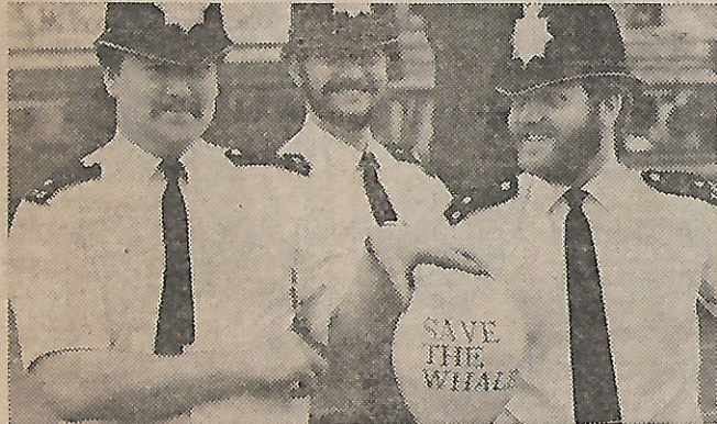
Save them... three bobbies back the campaign